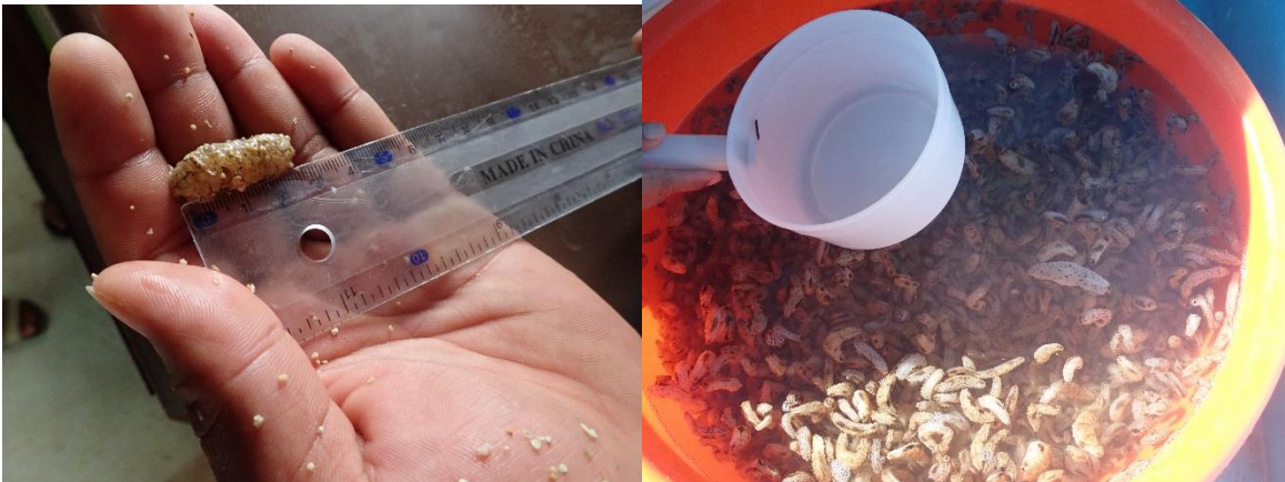
Left: measuring juveniles, Right: juveniles ready to be released

The Ministry of Fisheries is working together with Vast Ocean Aquaculture Co. Ltd to develop the deep sea farming program for young sea cucumbers. The purpose of this program is to develop a substantial sea cucumber export in the near future.