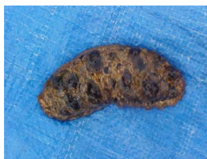
Sea cucumber (mokohunu)