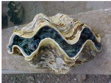
Giant clam (vasuva)