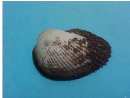
Ark shell (kaloa'a)